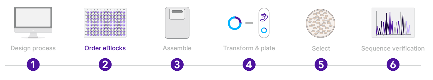
Figure 1. Example of high-thoughput workflow.

Unlike some other dsDNA synthesis vendors, IDT offers fragments without flanking (i.e., universal adapter) sequences at no extra cost. With no flanking sequences to remove, eBlocks are ready-to-use for various research applications, including antibody discovery, enzyme engineering, and vaccine research.